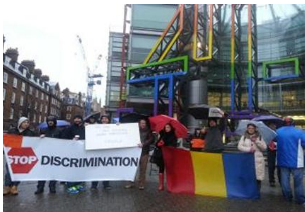
1 Romanians protesting against Discrimination in EU member state England

Recently channel 4 made a report on immigration from Romania to Great Britain. Although the documentation is based on facts and complies with standards of fair journalism it has been subject to criticism on the side of Romanian high ranking officials, such as the Romanian Ambassador in England and the prime minister of Romania Mr Ponta. Well even angry Romanians protested in front of the channel 4 building and demanded "a stop to discrimination".