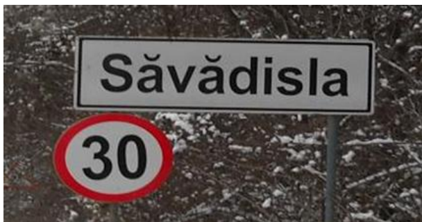
4. Language Rights are not respected in Savadisla, where 52 % of the population is ethnic Hungarian ( Tordaszentlaszlo ) , consequently Europeans are discriminated by the local authorities. Source www.tordaszentlaszlo.eu ;

Only after being beaten they asked me for my identification. As a reaction to this the police officer became emotional and asked me - while being outraged - " how it is possible that a Dutch persons speaks Hungarians ? " He was angry and very upset. After giving a very detailed description of what happened to the Dutch ambassador I filled an official charge. The trail is still going on and the racist and illegal (making false official reports ) behaviour of the Politia locala in Târgu Mures has been reported in the Dutch press in detail.