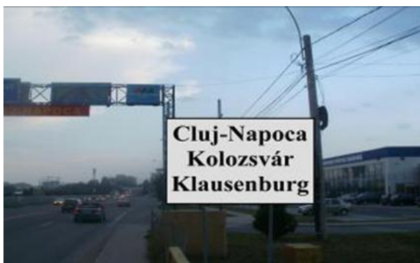
7. The major Of Cluj did everything to prevent a free Multilanguage sign paid for by Dutch taxpayers and obligatory according to Romania law. Source www.language-rights.eu ;

Migration is a totally one sided thing from Romania, since it is clearly not working the other way around. Many leaves Romania, but few go there. There are almost no Dutchmen, English, German or French living In Romania. In the Netherlands there are over 30 000 Romanians, but only around 1000 Dutch living in Romania, which is a ratio of 1 to 30. The Ratio for French. German and English is probably even worse !