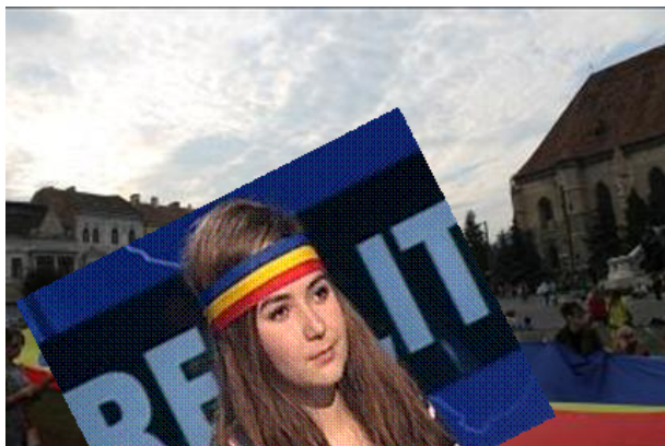
5. Romanian nationalists protesting for the annexation of Transnistria in a city where even symbolic language rights are denied since 1996 ! Romania has an obligation towards the NATO to comply with the Strasbourg treaty. ; 6. Xenophobia, Chauvinism and ethnic hate. Romania's contribution to the European Dream. Source www.visitcluj.eu ;